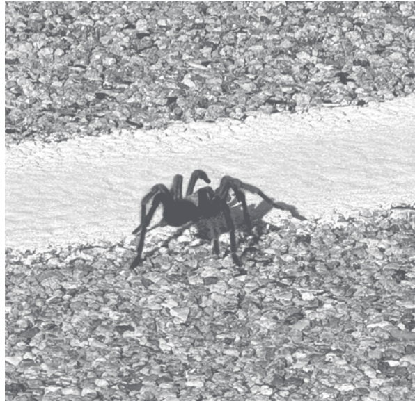
Tarantulas were spotted by CML staff members who traveled to La Junta for the District 6 meeting.